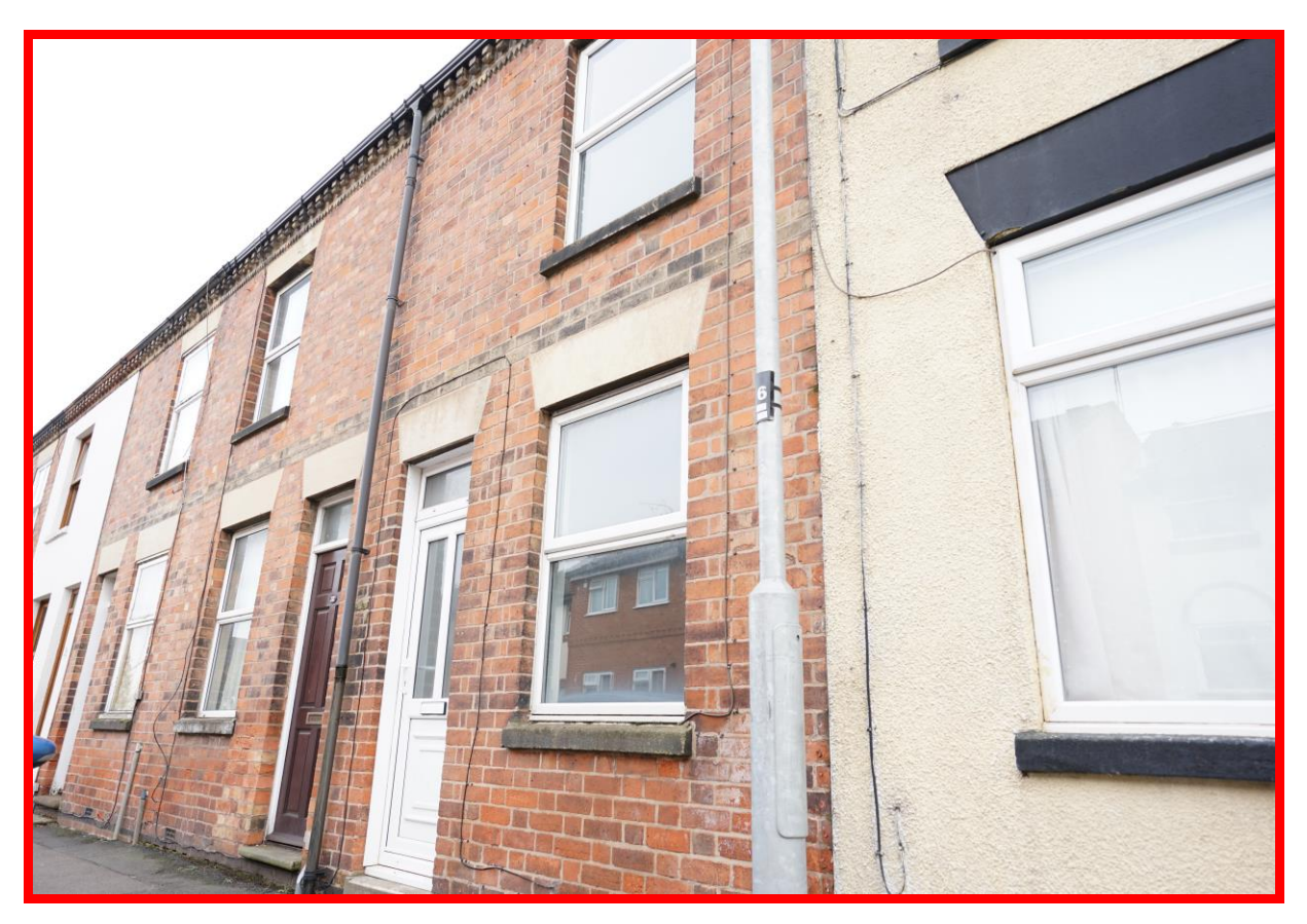
Rent £795,00 P.C.M.

This two bedroom inner terraced house located in Sileby has recently been completely refurbished and is immediately available to let. Located within walking distance from the train station, and close to local supermarket and numerous local shops and pubs with easy access to commute routes for Loughborough and Leicester. The property briefly comprises of a lounge, a kitchen, and a family bathroom on ground level and two spacious two double bedrooms on first elevation. With rear garden and outdoor WC. Parking available off road. Energy Rate D. Council Tax Band A. There is a holding deposit of £180.00 that will be required upon successful application for the property. Assuming that all criteria is met, a damage deposit of £735.00 will be required, along with the first month's rent, before the tenancy commences. Restrictions apply please contact the office for further details.